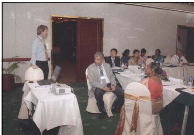
The STEPAN Informal Board Meeting in session in Colombo on 18 June 2009, to identify activities leading to the development of a work programme for 2009-2011.

Specifically, for example, Sri Lanka as the current chair of STEPAN will spearhead the task of improving network management and coordination, as well as prepare a proposal on an innovation study of the Asia-Pacific region. The Philippines will continue its lead role in the preparation of case studies on innovation in small and medium enterprises, a project carried over from the previous cycle when the Philippines was STEPAN Chair. Korea will take the