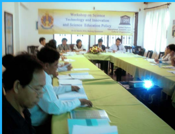
Cambodian stakeholders deliberate on the consultants' report and recommendations during a plenary session of the workshop.

The presentation by Jose Magpantay argued for a national innovation system (NIS) framework to achieve economic competitiveness and growth. The